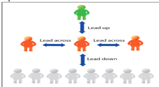
Diagram 1 360-Degree Leadership Idea